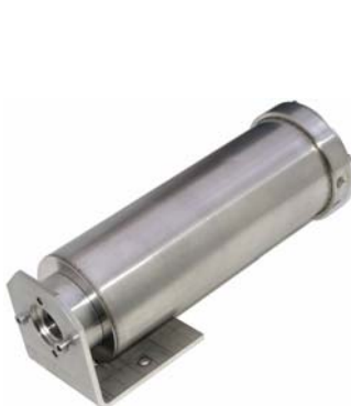
Protective and cooling housing WK15