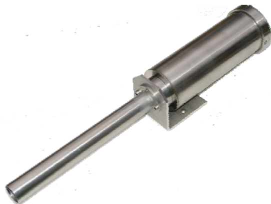
Protective and cooling housing with airpurg and extension tube