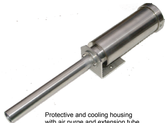
Protective and cooling housing with air purge and extension tube