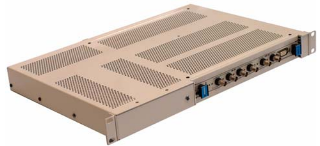
ABE056 Slimline (shown housing an MPC4 card)