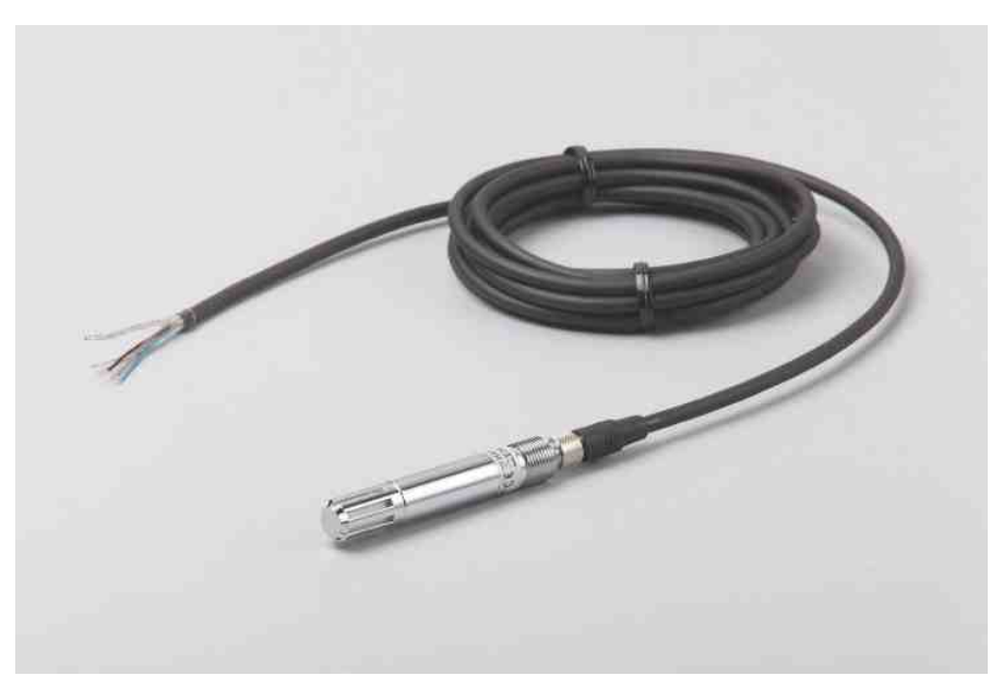
The HMP110 with excellent stability and high chemical tolerance.